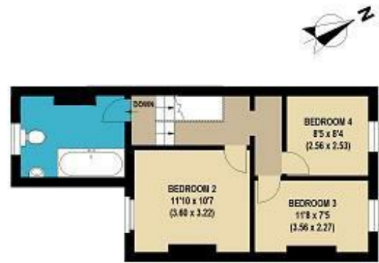
First Floor Approximate Gross Internal Area 45 sq m / 484 sq ft